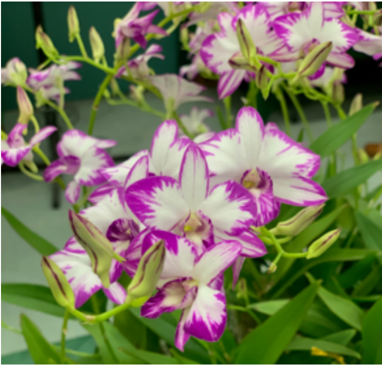
Den Enobi Purple 'Splash'