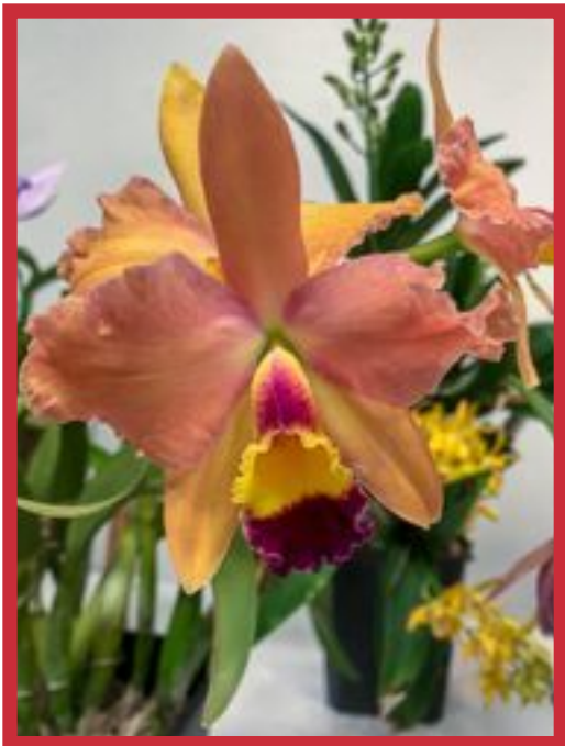
Lc. Hsing Excel x Pot. Rubescence