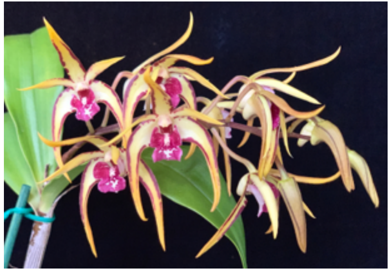
Den. Aussie Parade x AllynStar