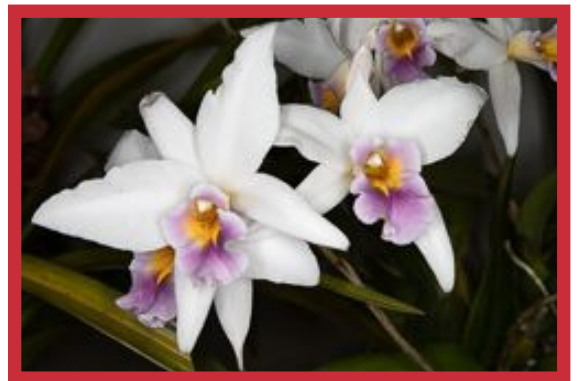
Lc. Blue Sky – Stewart Walton