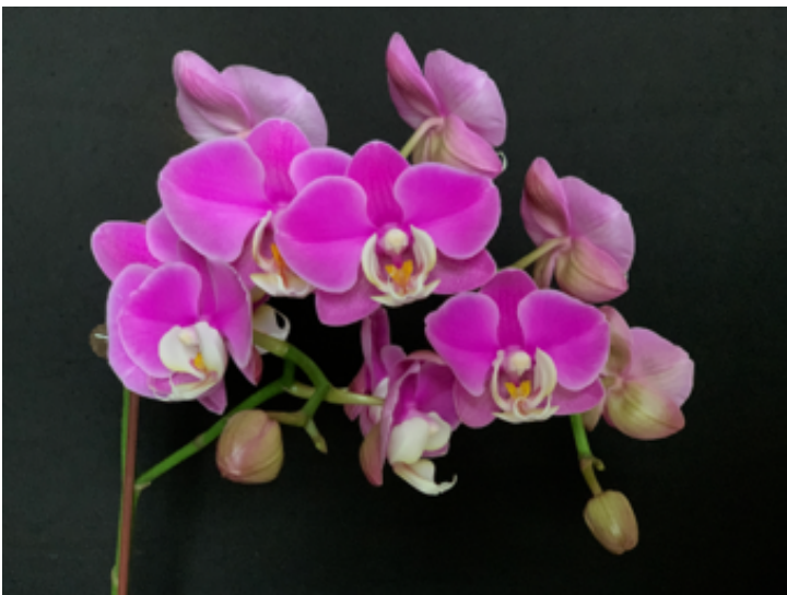
Phal. Taida Blush