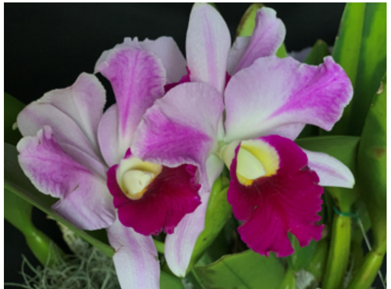
Lc. Supersonic 'Striking Lip'